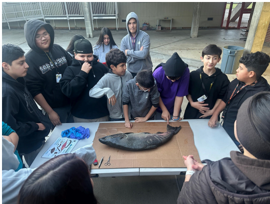
Salmon dissection

TN hosted a 4-week after school program at Pioneer Middle School in Wenatchee, WA. The after school program specifically targeted middle school age as these students have a gap in their salmon education after the 3rd-5th grade curriculum. Each session focused on a different component of salmon education including a salmon lifecycle activity, a salmon dissection, gyotaku, and the building a healthy salmon stream activity mentioned above. Students had a great time and learned lots about salmon! Below are photos of the realized activities throughout the 4-week program.